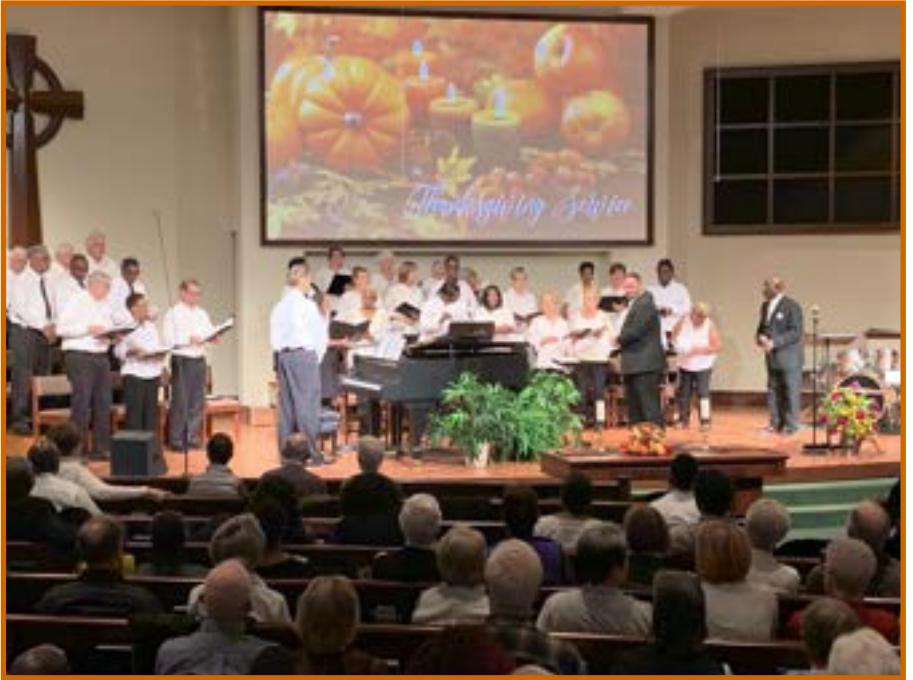
Gospel concerts sponsored by the Compassion, Peace & Justice Committee feature voices from Unity Presbyterian and local black churches.