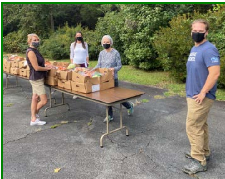
Fresh food distribution event held in conjunction with Ebenezer United Methodist Church.