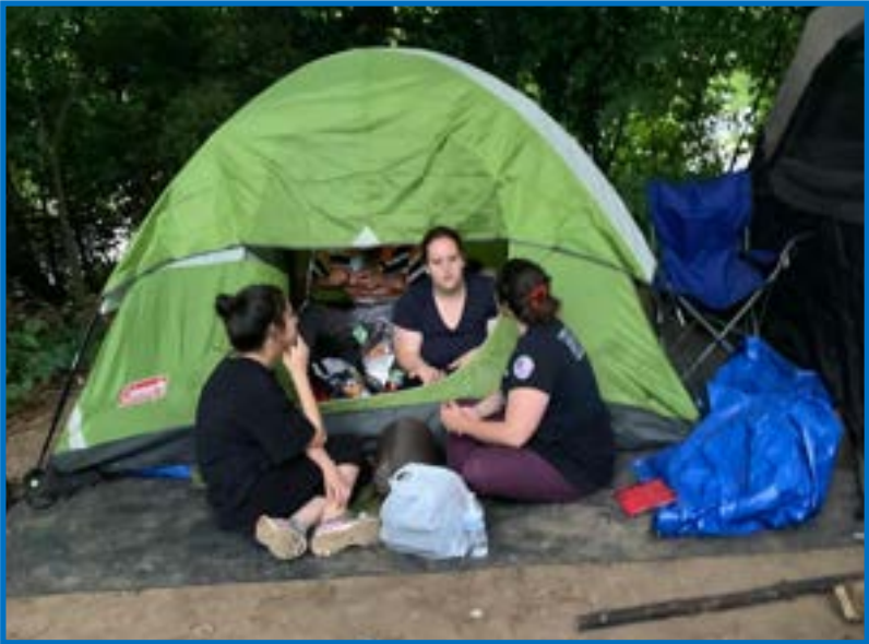
Volunteers from Watchmen of the Street share supplies and spend time in homeless camps around Charlotte NC area.