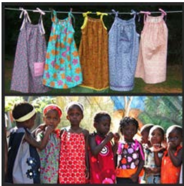
Dresses made by Presbyterian Women for children in Nigeria and Guatemala.