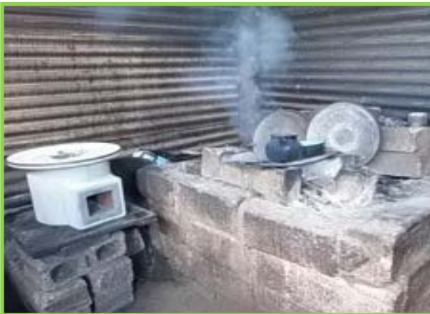
Ecocina stove shown beside a traditional cooking method.

Unity Contact: Gail Satterthwaite, g.satt@att.net