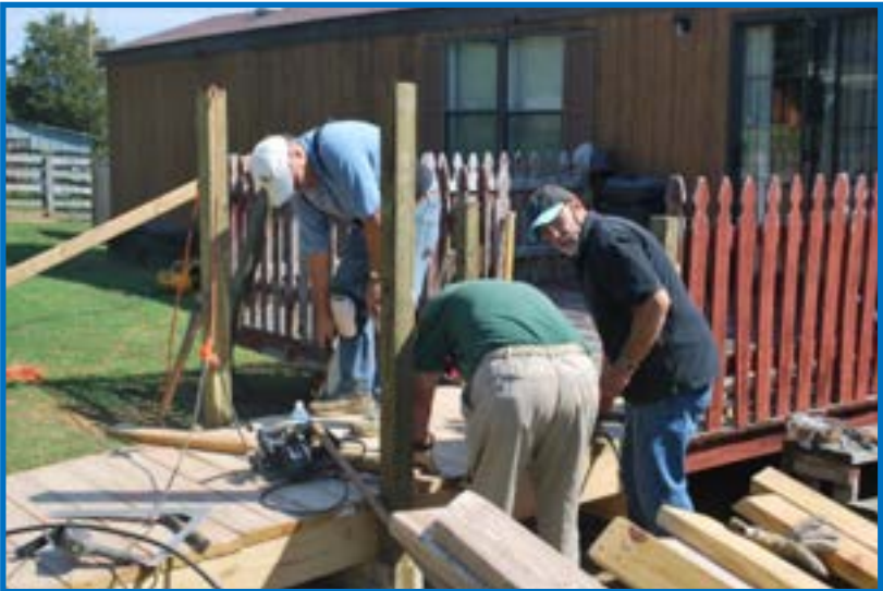
Members of the Unity Construction Crew build wheelchair ramps and make household repairs in Denver NC area.