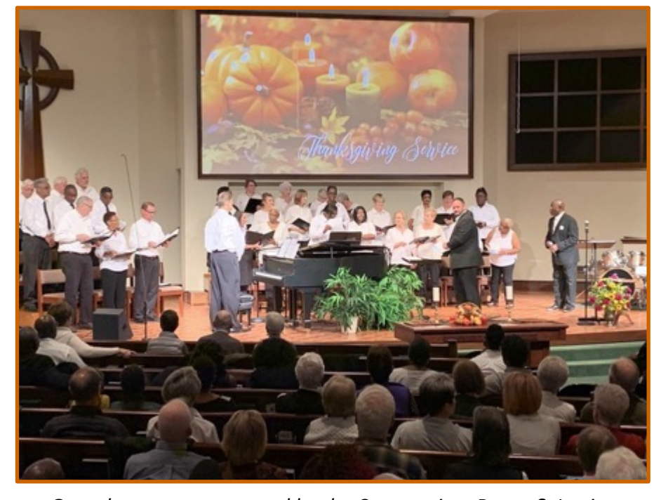
Gospel concerts sponsored by the Compassion, Peace & Justice Committee feature voices from Unity Presbyterian and local black churches.