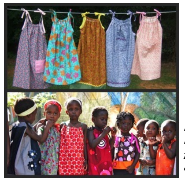
Dresses made by Presbyterian Women for children in Nigeria and Guatemala.