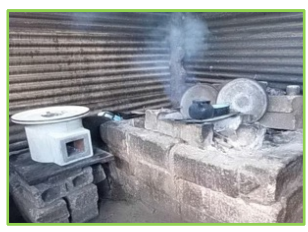
Ecocina stove shown beside a traditional cooking method.

Unity Contact: Gail Satterthwaite, g.satt@att.net