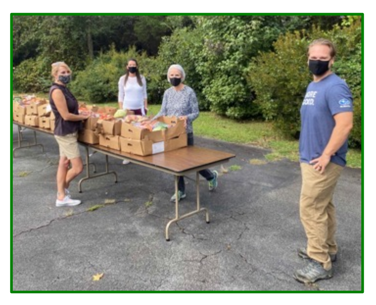
Fresh food distribution event held in conjunction with Ebenezer United Methodist Church.

Unity Contact: Charles & Norma Bohlen, bohlen@bellsouth.net