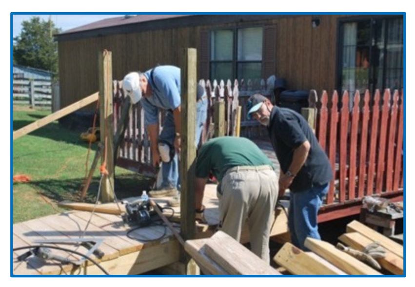
Members of the Unity Construction Crew build wheelchair ramps and make household repairs in Denver NC area.